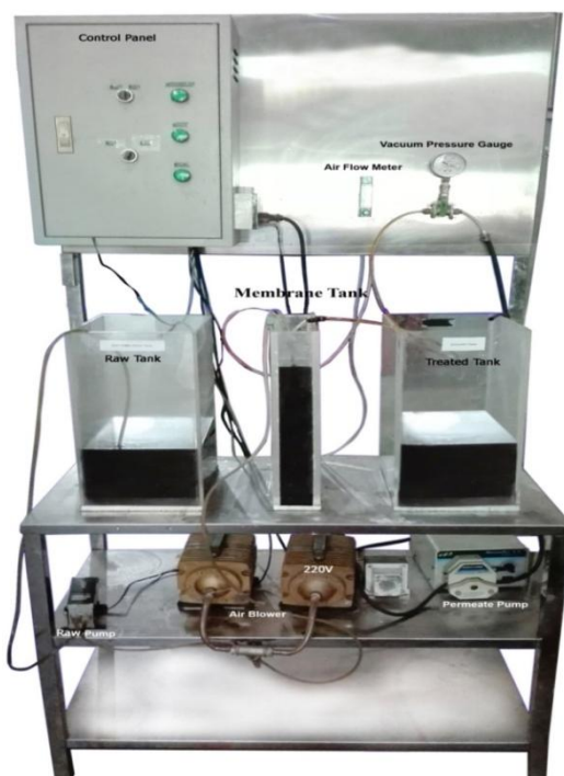
Figure 1 Treatment of Fish Sauce by Ultrafiltration Membrane Process Assembly Results