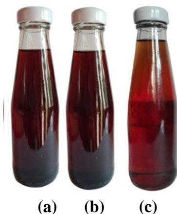
Figure3 (a) = Fish Sauce, before Treatment (b) = Fish Sauce after Treatment by Membrane Filtration (c) = Fish Sauce after Treatment by Adsorbent (Activated Carbon)